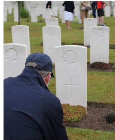
Pilgrimage of Remembrance

Learn more about The Legion National Foundation at: LNFCanada.ca