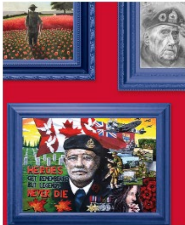
Remembrance Contests for Children and Youth

The Legion National Foundation (LNF) was established by The Royal Canadian Legion. It was incorporated under the Canada Not-for-Profit Corporations Act and is a registered charity. With the assistance of The Royal Canadian Legion, LNF conducts charitable activities including Remembrance contests for youth, The Teachers' Guide, and Pilgrimages of Remembrance.