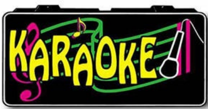
Every Friday Night 7pm – 11pm