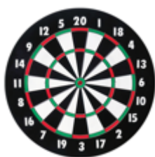
Fun Darts Every Wednesday Night 6pm – 9pm

For complete information on the bursaries and scholarships available from Montgomery Branch, please contact us .