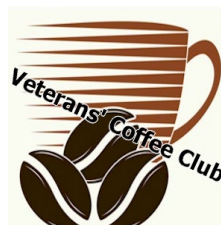
Every second Thursday 10:00am to 12:00pm